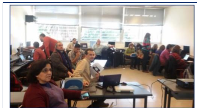
Fig 4 – Workshop for teachers in Geography

Based on Free/Libre Open Source GIS software, the initiative was the result of collective work that included the coordinated participation of four institutions: the National Bureau of Surveying, the gvSIG Association (Spain), the Geospatial Information Technologies Working Group (GTIG) of the College of Engineering (UDELAR), and the Ceibal Center (Centro Ceibal).