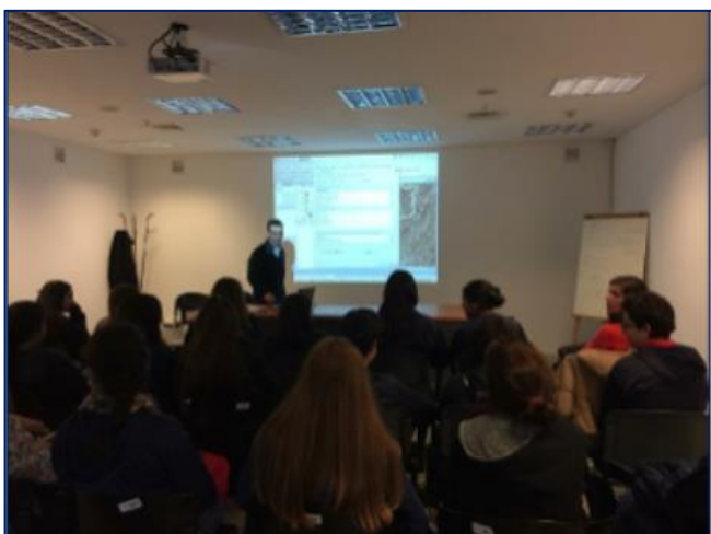
Fig 5 – Presentation for students and outreach