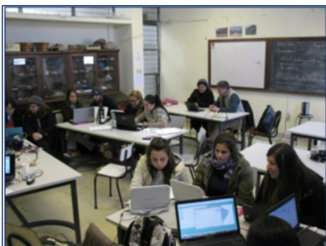
Fig 6 - Course for students to be teachers in Geography