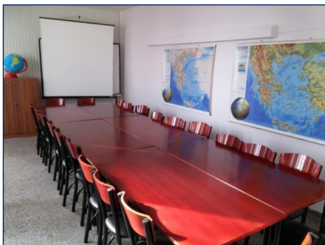
Fig 1 – Main meeting area of the Centre