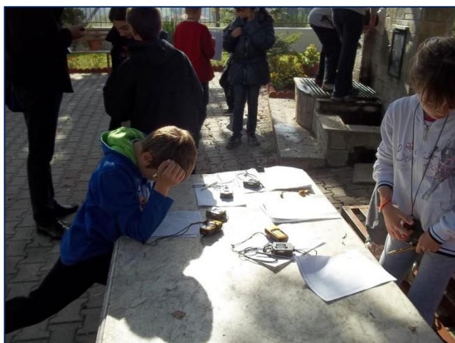
Fig 3 – Students using GPS and maps to learn

They are engaged in open source geospatial research for geospatial software and data, and there is an excellent range of research projects. They also run very successful courses in Open Source GIS and Geospatial technologies ranging from introductory level to more advanced courses covering GIS in greater depth.