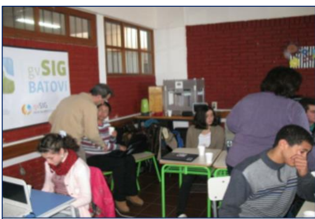
Fig 7 – Workshop for secondary students.

Teaching spatial literacy in schools is key for also helping build good global citizens. Through our new initiative of Geo4All Schools we aim to use geotechnologies as a usecase to advance STEM interest in Schools through Open Principles so that